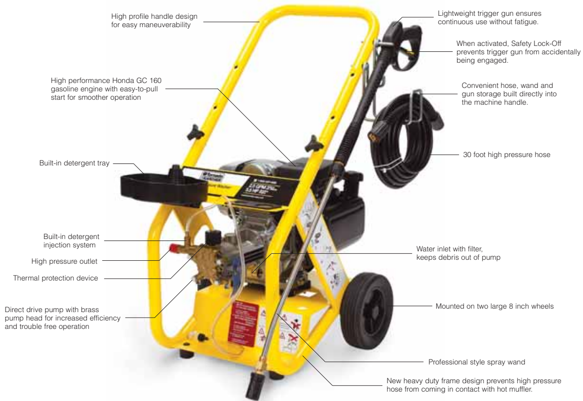
5.0 HP 2400 PSI

operator and engine safety features are just a few reasons why our pressure washer designs are the most popular worldwide. Not to mention, amazing performance and unmatched durability.