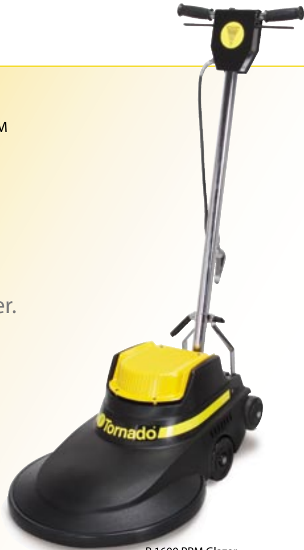
P 1600 RPM Glazer

The ultimate value and choice in high-speed burnishing power.