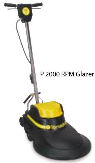
P 2000 RPM Glazer